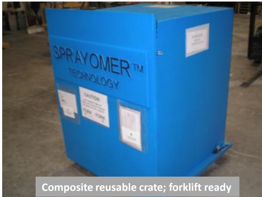
Composite reusable crate; forklift ready