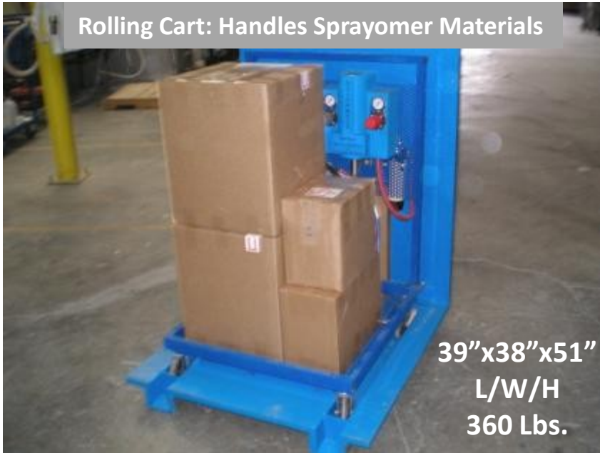
Rolling Cart: Handles Sprayomer Materials

OPTIMIZED VACUUM BAGS SR COMPOSITES, LLC ALL RIGHTS RESERVED, © 2009 OPTIMIZED VACUUM BAGS