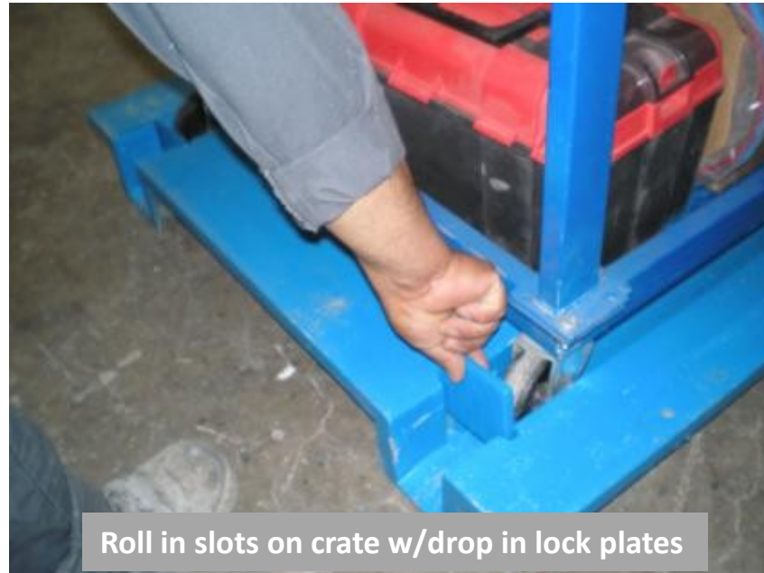
Roll in slots on crate w/drop in lock plates