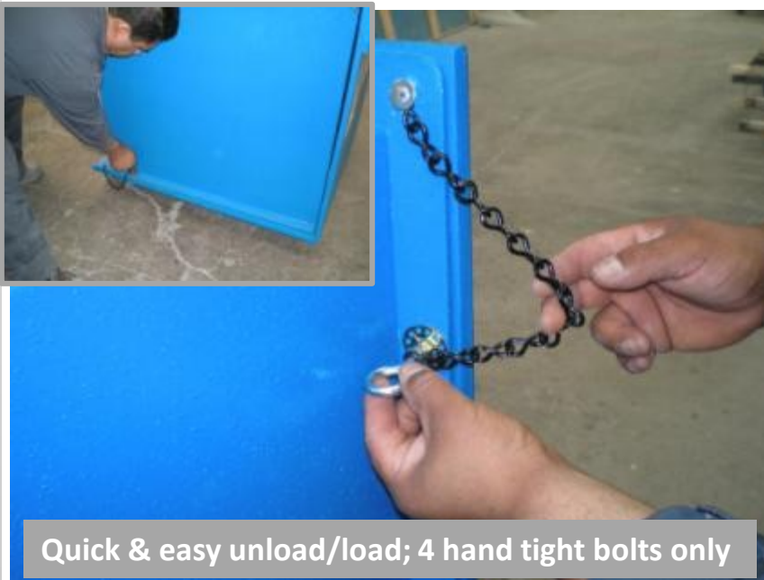
Quick & easy unload/load; 4 hand tight bolts only